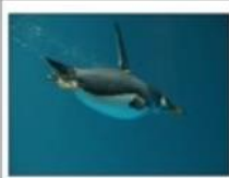
Gentoo penguin eating

Penguins eat sea life. They eat animals they catch in the ocean. Smaller penguins eat krill and squid. The larger penguins eat fish. They catch krill, squid, and fish with their bills while they dive through the water. Penguins have spiny tongues and strong jaws to help them capture their prey. Penguins eat while they swim swallowing their food whole. Penguins are able to drink seawater.